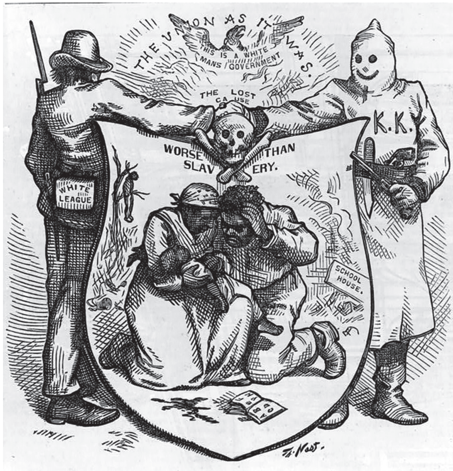
A cartoon published in an American magazine, October 1874.